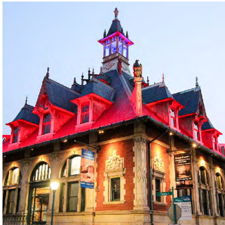
Customs House Museum & Cultural Center

Hosted by The Customs House Museum and Cultural Center