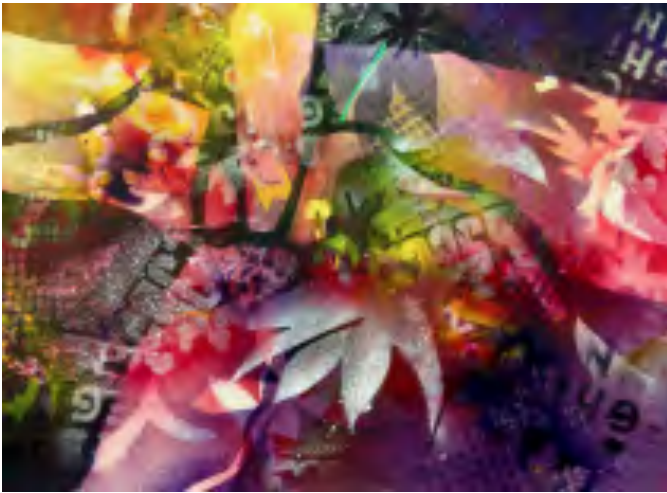
Not Your Everyday Cha Cha by Claudia Balthrop

It's a watercolor utilizing only indirect painting methods such as spray paint, atomizer, splatter...no brushwork