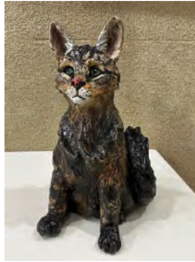
Tobias the Cat by Holly Beck