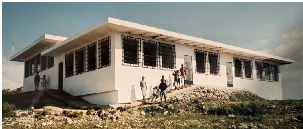
Completed school building

voice and the excitement of such a remarkable