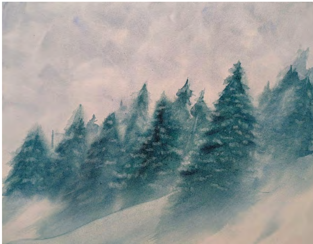
Blustery Day by Lisa Cantrell