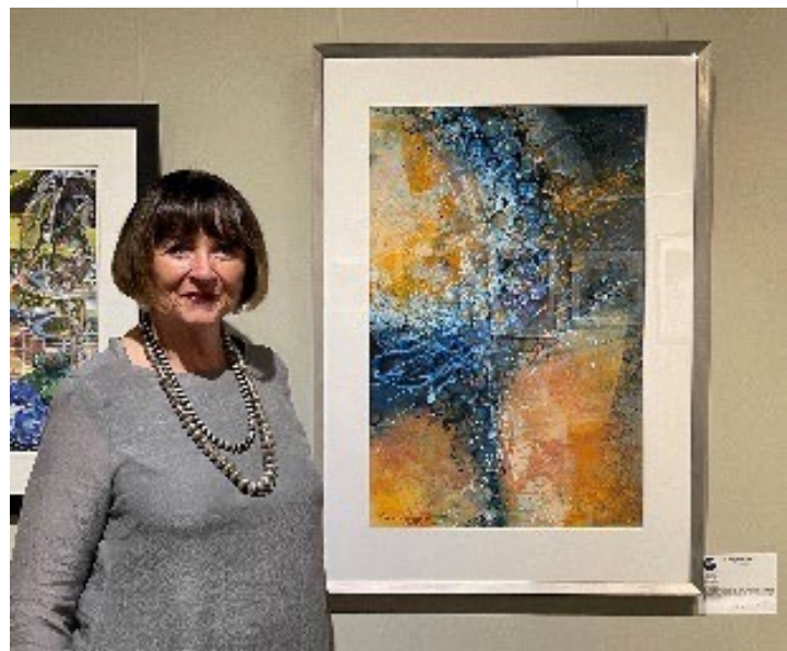
Celestial By Connie Hendrix

The National Watercolor Society is one of the oldest non-profit artist-led societies in the United States.