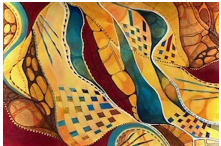
River Runs Through By Faye Ives