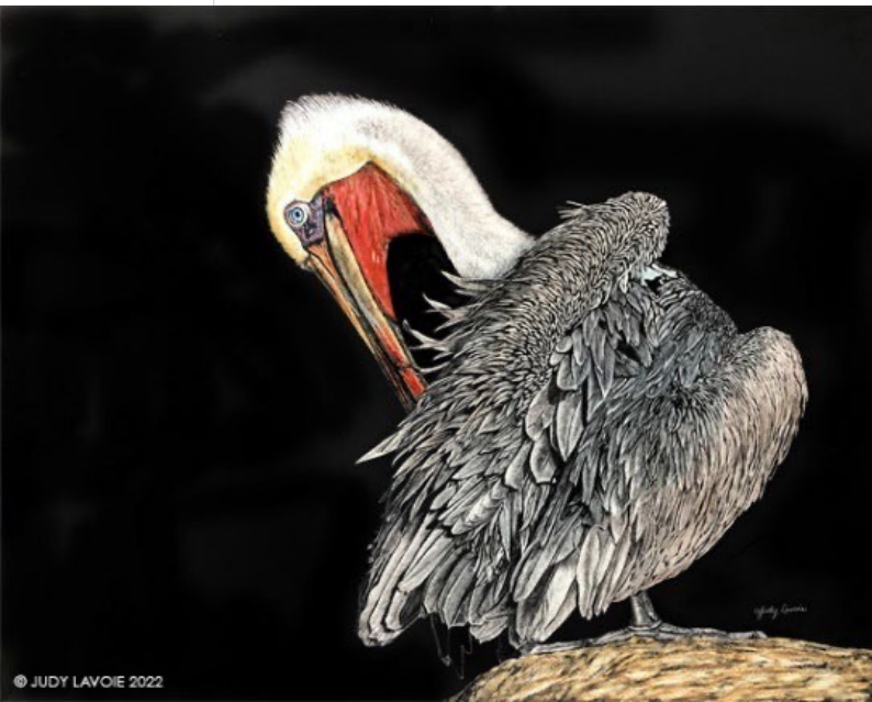
Breeding Plumage