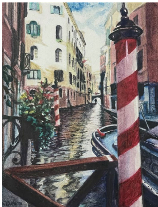
Venice Canal By Janice Ducharme