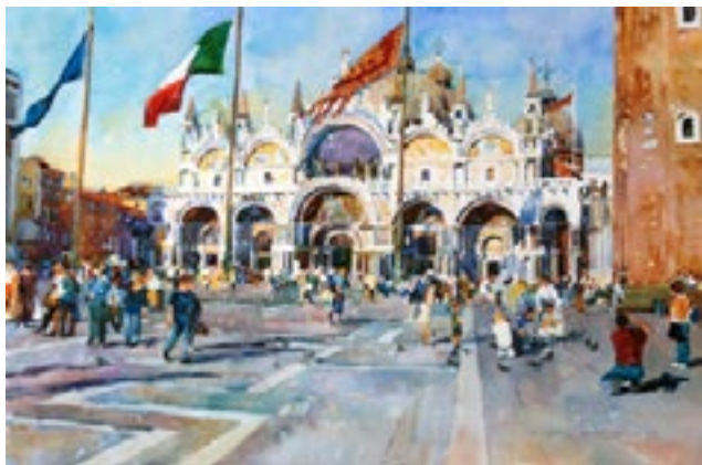
Piazza San Marco, Venice, Italy