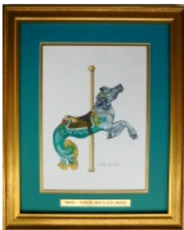
Nemo, Seahorse by Harris Family